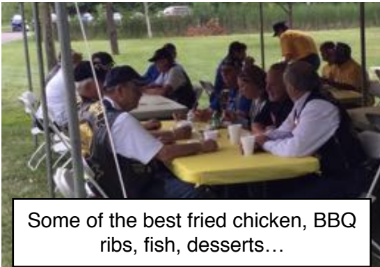
Some of the best fried chicken, BBQ ribs, fish, desserts...