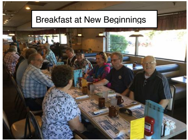
Breakfast at New Beginnings