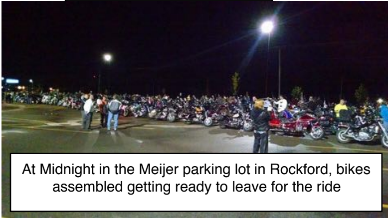
At Midnight in the Meijer parking lot in Rockford, bikes assembled getting ready to leave for the ride