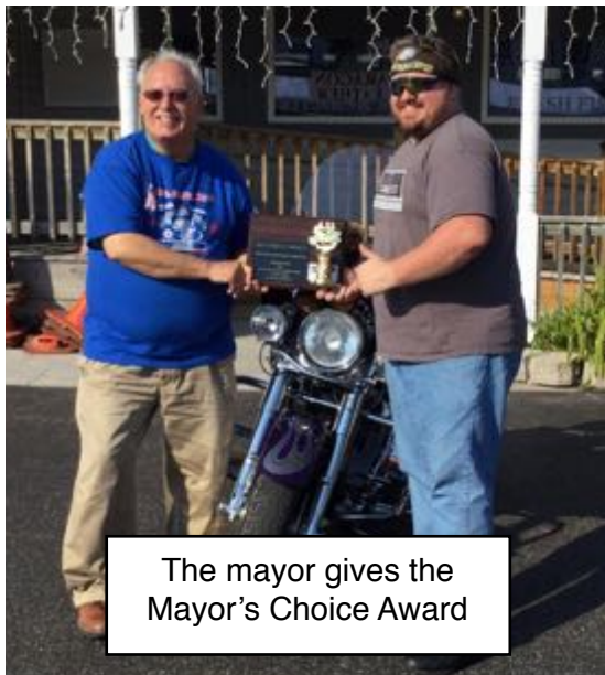
The mayor gives the Mayor's Choice Award