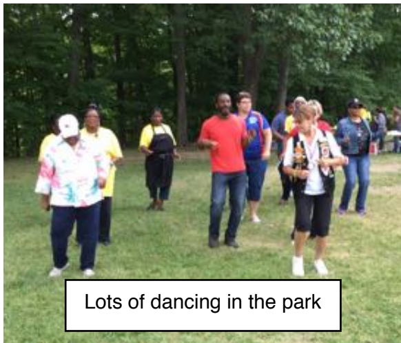
Lots of dancing in the park