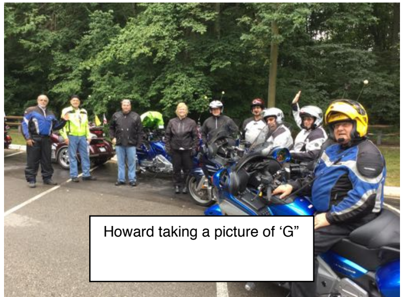
Howard taking a picture of 'G'