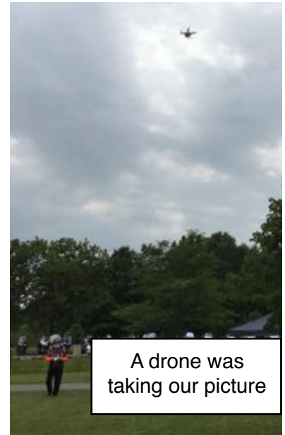
A drone was taking our picture